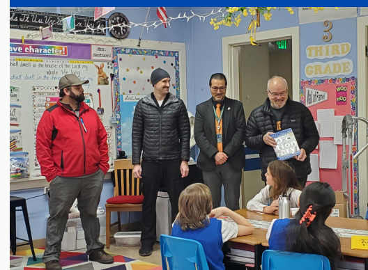
Mt. Vernon Rotary donated dictionaries to each 3rd grader