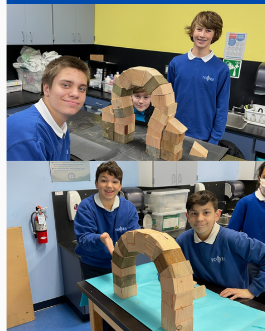
ICRS STEM Club learned about types of arches this week

QUICK LINKS VOLUNTEER RECORD LENT CALENDAR SAFE ENVIRONMENT OPT OUT RAISE THE PADDLE EARLY