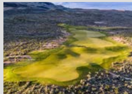
Gamble Sands Play and Stay