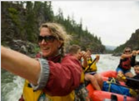
Montana Rafting Trip

HERE ARE JUST A FEW OF THE ITEMS AVAILABLE.